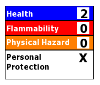
HMIS RATINGS (0-4)